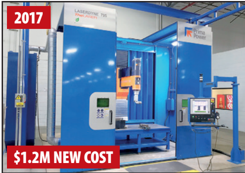
PRIMA POWER LASERDYNE 795 XL 5-AXIS FIBER LASER

Including: Prima Power 5-Axis Laser Systems, Machining Centers, CNC Turning Centers, Plate Rolls, Shear, Planishers, Longitudinal & Circular Seam Welders, Lincoln & Miller Welders, Robotic Welding Systems, Fume & Dust Collectors, Hydraulic Cake Expanders, CMM's, X-Ray Inspection & Calibration Systems & Much More