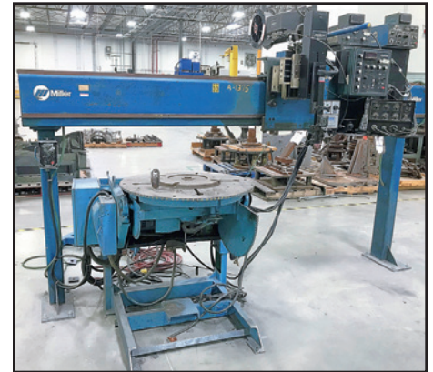
MILLER 9' GANTRY WELDER SYSTEM

KOIKE ARONSON LD300N-TIG-1 WELD POSITIONER , s/n 9Z01, 14" Diameter Table, 660 Lb Capacity