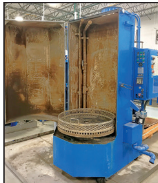
KEMAC INDUSTRIAL HEATED WASH SYSTEM