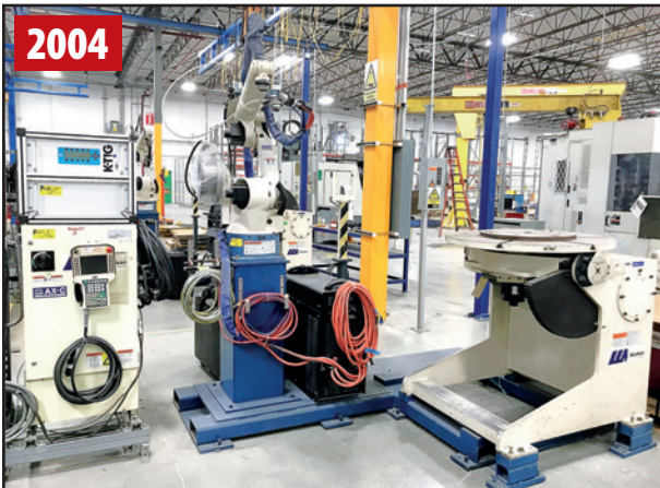
DAIHEN AX-MV6 6-AXIS ROBOTIC WELDING CELL