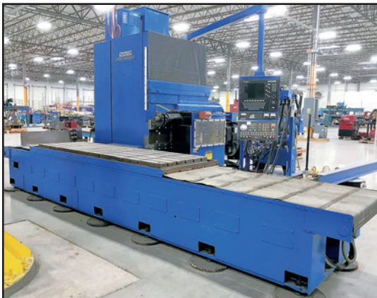
CINCINNATI 20H CINTIMATIC HORIZONTAL MACHINING CENTER

RING EXPANSION LINE COMPRISING (5) RIPPLERS W/MCLEAN HEAT EXCHANGERS, Eaton Vickers Pumps