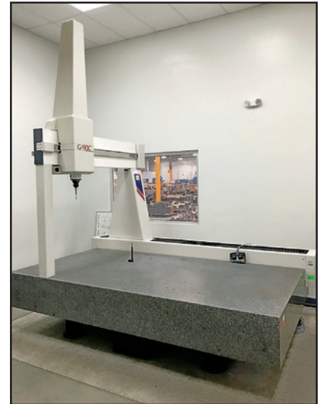
LK G-90C COORDINATE MEASURING MACHINE

2018 FAROARM QUANTUM S 8-AXIS PORTABLE METROLOGY ARM