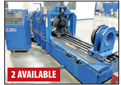
EMR ACRALINE DRUM PUNCH MACHINE