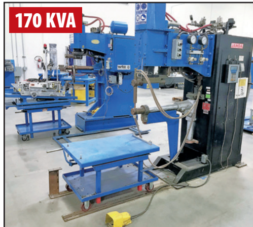
JANDA PMFD317036 SPOT WELDER