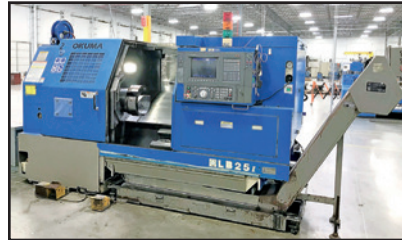
OKUMA LB25II CNC TURNING CENTER