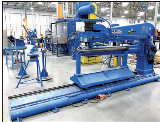
AIRLINE 72" PLANISHER