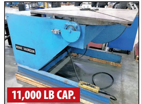
KOIKE ARONSON MD5000 POSITIONER