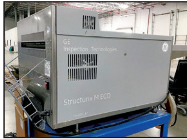
GE STRUCTURIX M ECO X-RAY PROCESSOR