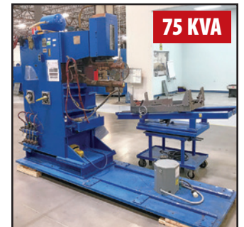
TELEDYNE PEER P-100 SPOT WELDER

View our current auction schedule at www.perfectionindustrial.com