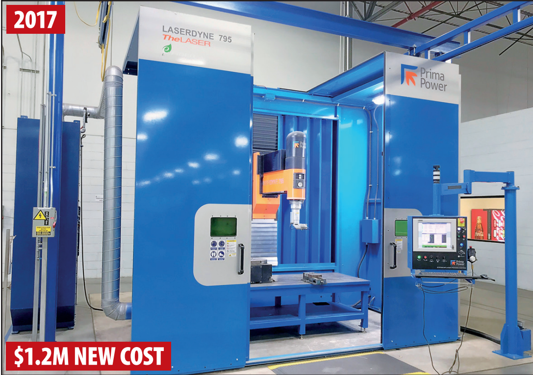
PRIMA POWER LASERDYNE 795 XL 5-AXIS FIBER LASER

Surplus to the Ongoing Operations of Integrated Energy Technologies, Inc., a Delaware Corporation, a Subsidiary of Doncasters US Holdings 2018, Inc.