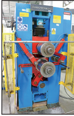
GROTNES C-5700-A 3-ROLL UNIVERSAL BENDER

GROTNES C-5700-A 3-ROLL UNIVERSAL BENDING MACHINE, s/n 0356