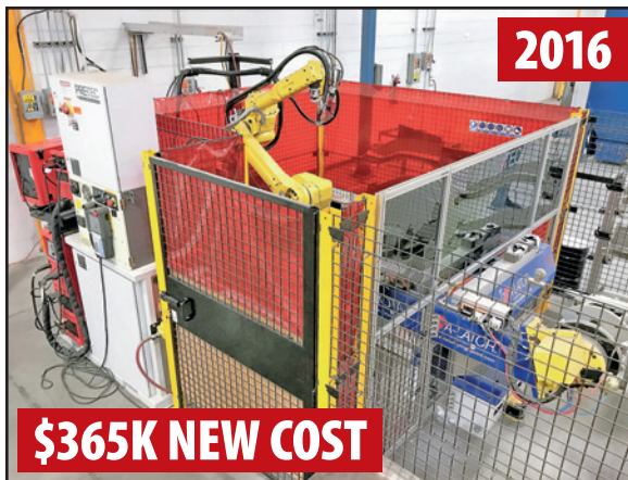
PRE-TEC/FANUC M-201A 6-AXIS ROBOTIC WELDING CELL

Sale Date: Wednesday, November 14 at 10:00 AM PT