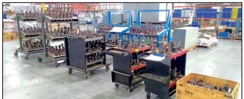
ASSORTMENT OF TOOLING