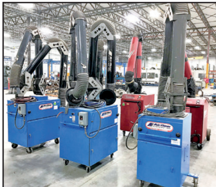
ASSORTED FUME COLLECTION SYSTEMS