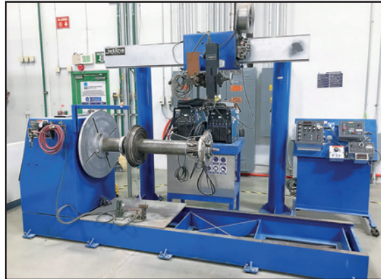
JETLINE ENGINEERING CW5-72Z CIRCULAR WELDER