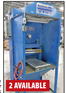
FILTER 1 DOWNDRAFT TABLES

SHIPPING DOCUMENTATION FOR BUYERS OUTSIDE OF MEXICO, MEXICO MAQUILADORA BUYERS AND NON-MAQUILADORA BUYERS WILL BE PROVIDED UPON RECEIVING ALL REQUIRED INFORMATION FROM ALL BUYERS. DOOR-TO-DOOR RIGGING AND SHIPMENT SERVICES OFFERED VIA COMPANIES LISTED ON OUR WEBSITE FOR ALL BUYERS.