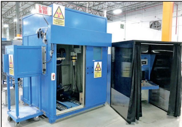
BOSELLO X-RAY SYSTEM