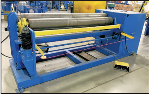
BUILT-RITE NEW DIMENSION P6.250 3-ROLL PLATE BENDING ROLL