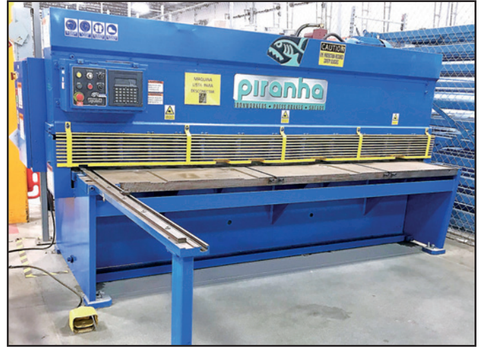
PIRANHA M1/4-10 POWER SQUARING SHEAR