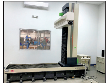
MITUTOYO CHN1612 COORDINATE MEASURING MACHINE