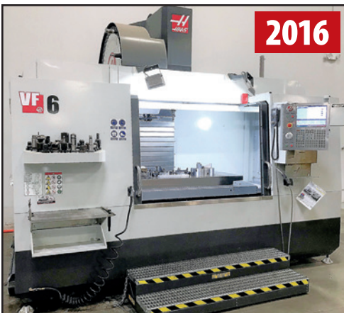
HAAS VF-6/40 CNC VERTICAL MACHINING CENTER

INCLUDING: PRIMA POWER 5-AXIS LASER SYSTEMS, MACHINING CENTERS, CNC TURNING CENTERS, PLATE ROLLS, SHEAR, PLANISHERS, LONGITUDINAL & CIRCULAR SEAM WELDERS, LINCOLN & MILLER WELDERS, ROBOTIC WELDING SYSTEMS, FUME & DUST COLLECTORS, HYDRAULIC CAKE EXPANDERS, CMM'S, X-RAY INSPECTION & CALIBRATION SYSTEMS & MUCH MORE