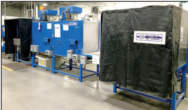
FLUORESCENT PENETRANT INSPECTION LINE