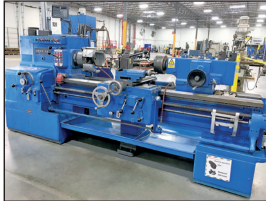
AMERICAN 16" X 54" LATHE W/DRO

ALSO AVAILABLE: (5) DIAMOND GROUND PRODUCTS PIRANHA III TUNGSTEN GRINDERS, DISC SANDERS, AND MORE