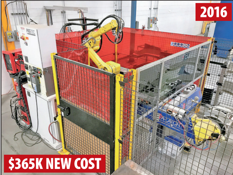
PRE-TEC/FANUC M-201A 6-AXIS ROBOTIC WELDING CELL

50 KVA BANNER 1AP50A12 SPOT WELDER , s/n 4128, w/Technitron T2050 Weld Control