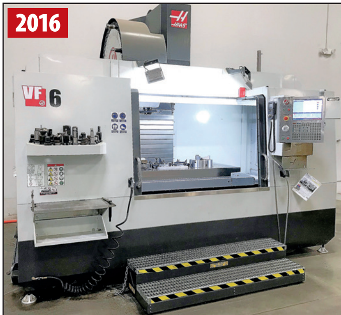
HAAS VF-6/40 CNC VERTICAL MACHINING CENTER

OKUMA & HOWA ACT 35 CNC TURNING CENTER , s/n 00120, Fanuc 18-T CNC Control, 12-Position Turret, 12" 3-Jaw Chuck, 20" Swing, 24" Machining Length, 3,500 RPM