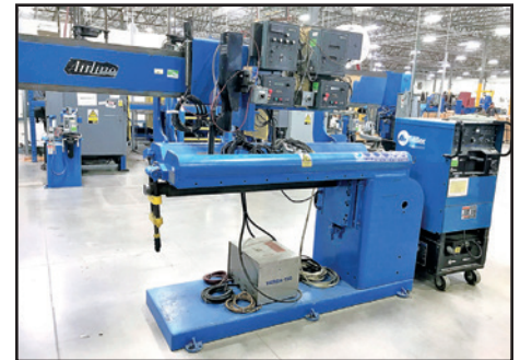
AIRLINE/PERFECTO 48" SEAM WELDER