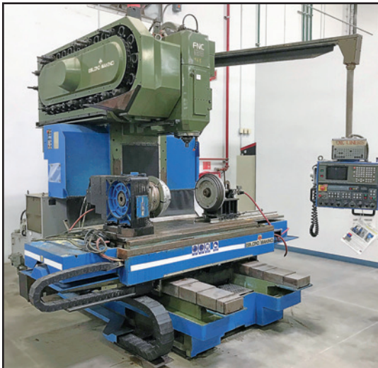
LEBLOND MAKINO FNC128-A30 CNC VERTICAL MACHINING CENTER